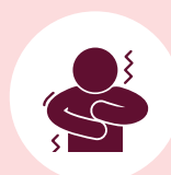
Low body temperature