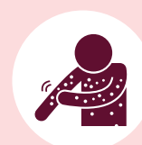
Blotchy or discoloured skin