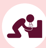
Nausea and vomiting