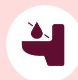
Low or no urine output