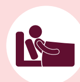
Fatigue or weakness