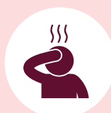
Fever and chills

Remember not all need to be present and can be mild