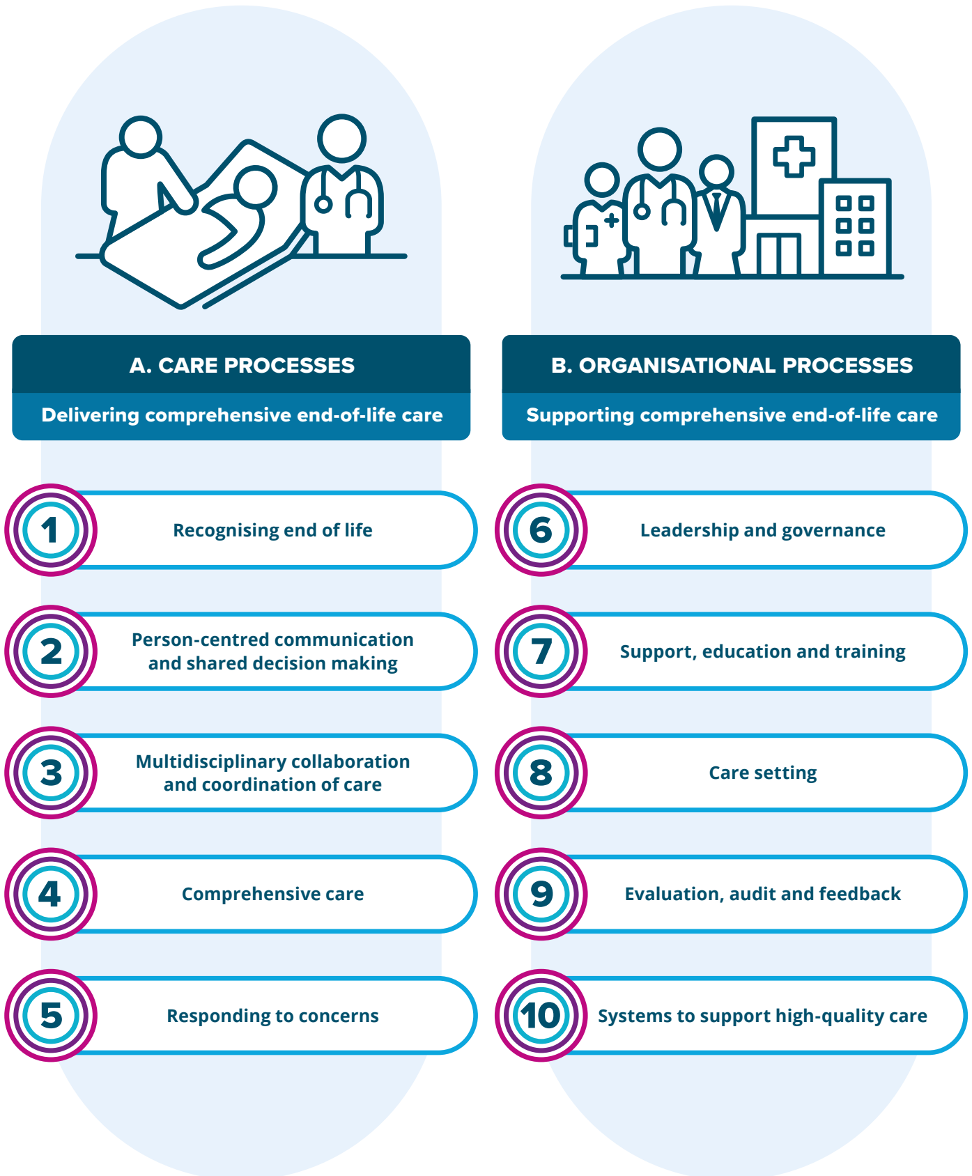
Figure 1: Overview of the 10 essential elements for safe and high-quality end-of-life care