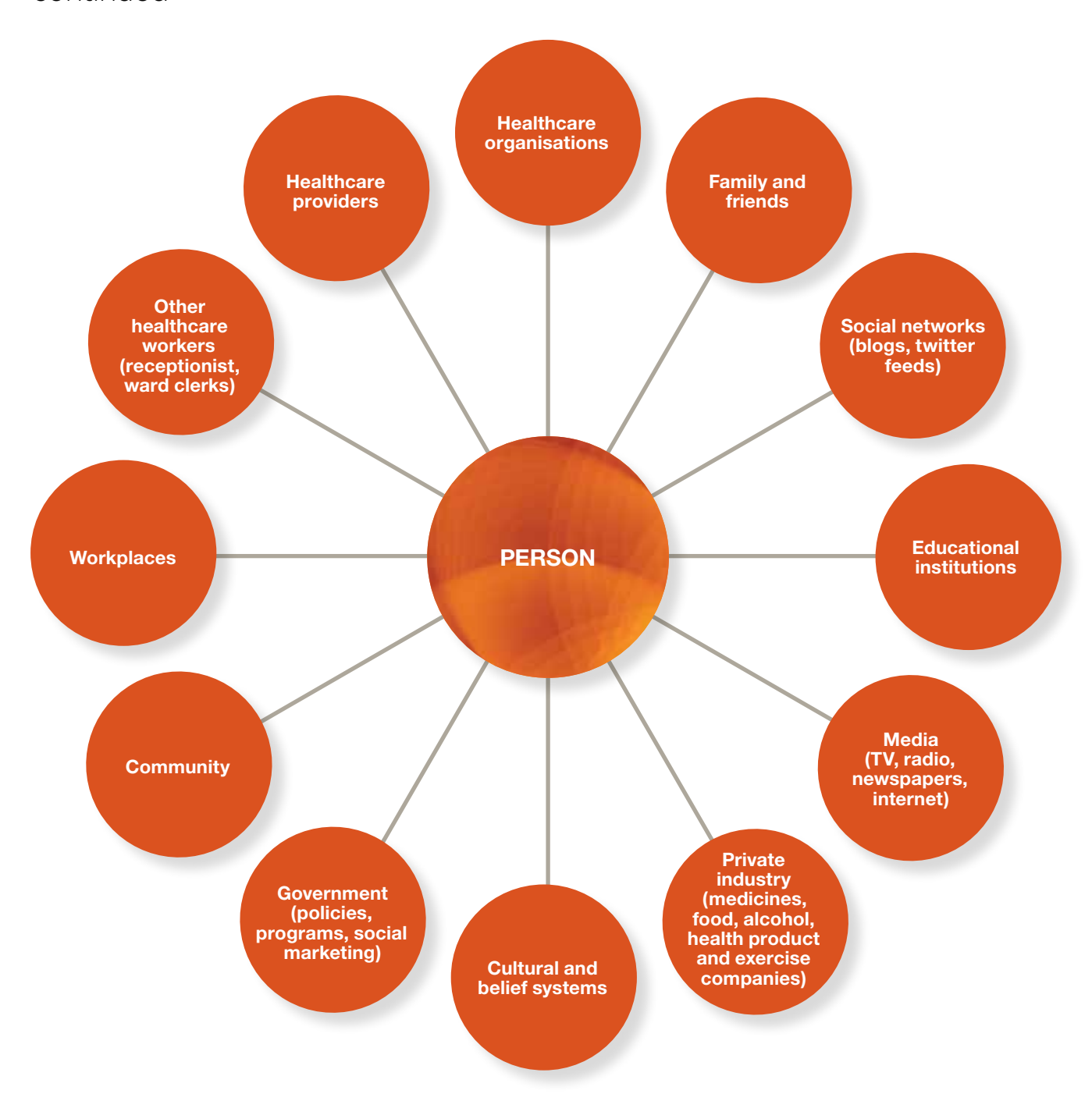
Figure 3 Examples of sources of information for consumers about health and health care

Changes in technology and expectations about consumer involvement in health care are leading to an increase in the access and use of health information from digital sources. For example, a 2010 survey in the United States by PriceWaterhouseCoopers found that people use online tools and resources (54 per cent) second only to consulting a physician (75 per cent) when gathering information on treatments and conditions. A provides an example of health information available on social media.