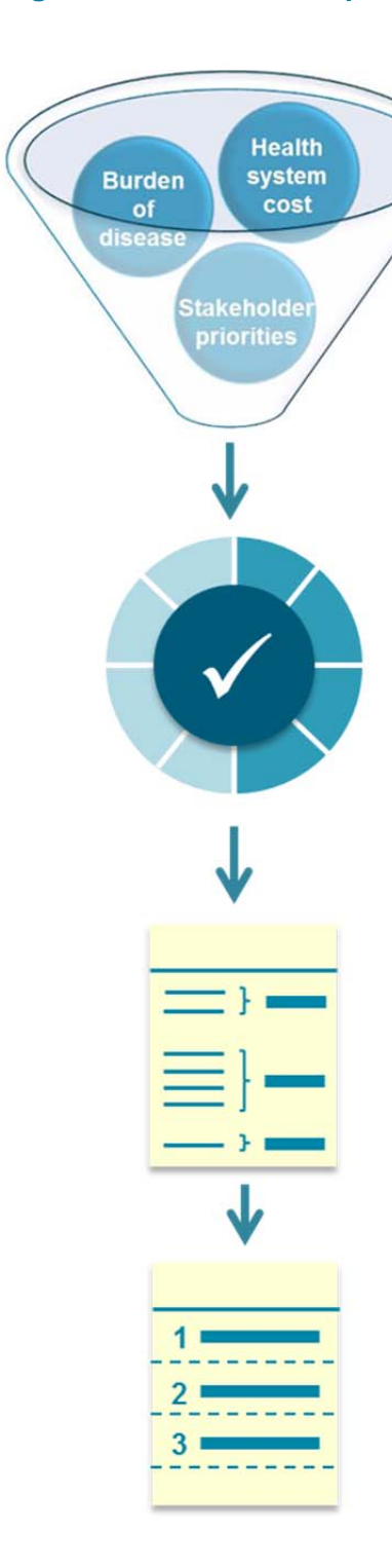
Figure 3: Prioritisation process