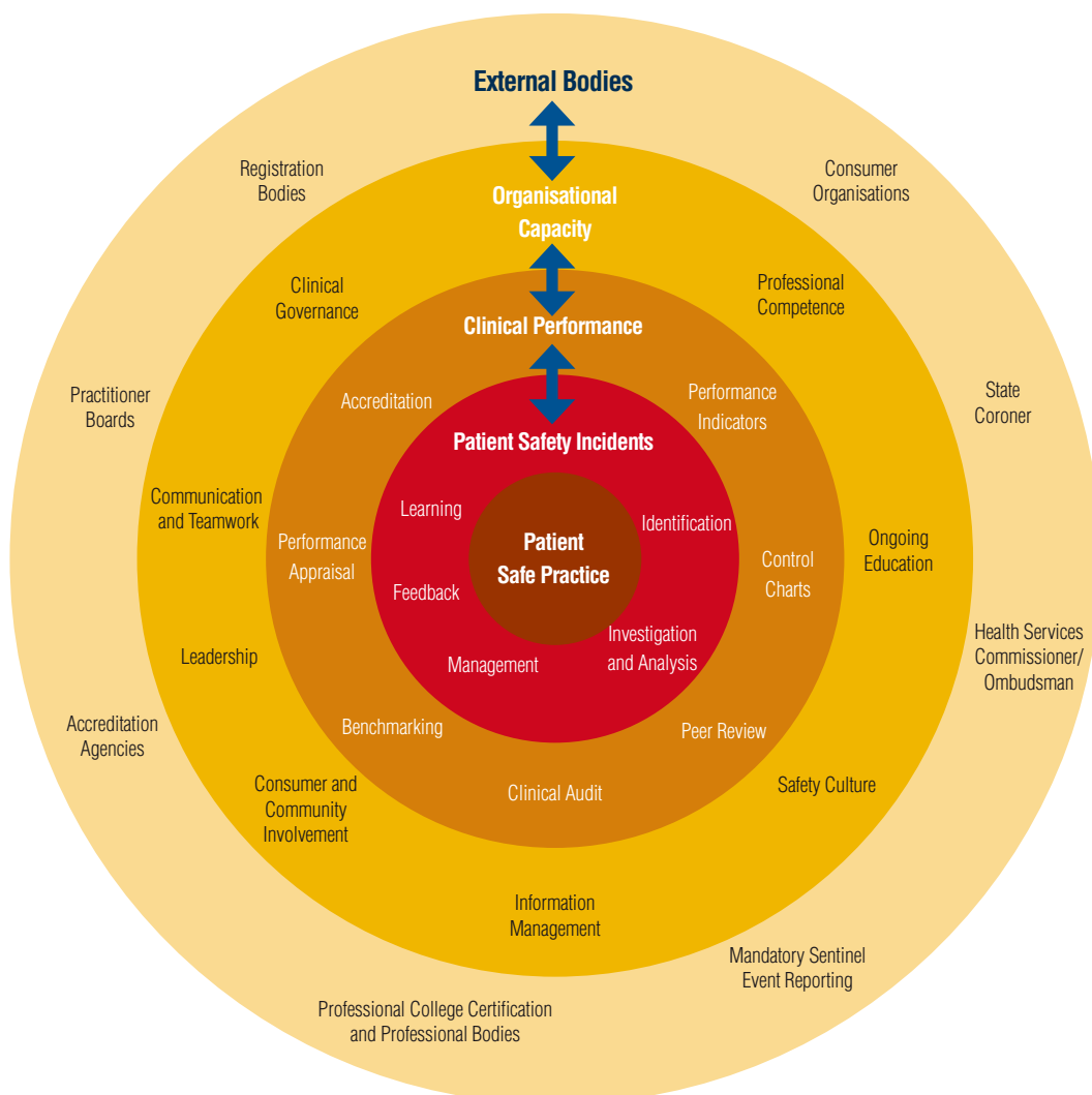
Figure 6: Health care safety system

The health care safety system is comprised of many facets, one of which is patient safety measurement (see Figure 6 below). It is important that the measurement of patient safety is integrated within this broader safety system.